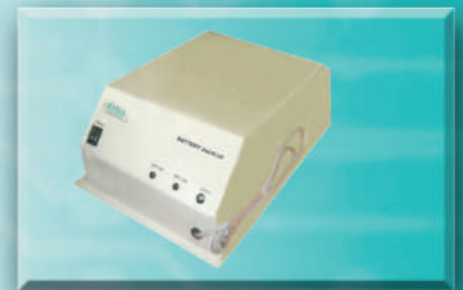
Battery Backup Unit