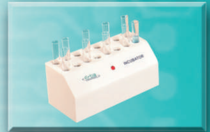
16 Position Dry Bath Incubator