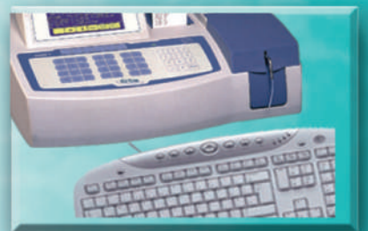
PC Keyboard Interface