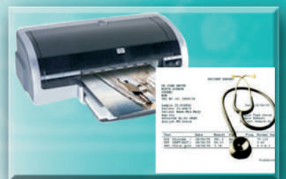
Direct Patient Result Reporting

1 Specifications are subject to change without prior notice. Accessories shown are not part of the standard accessories